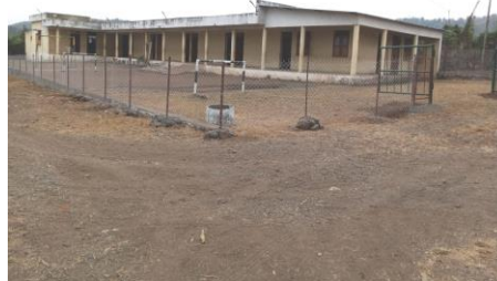
Primary School, Marapadol with fencing, gate with lock and khidki

Boom barrier is being installed in Rajaborari apart from facilities like dynamic Dayal Bhandar and kiosk for students. Everybody in the Neighbourhood, as defined by: Murar Declaration at National Level; and Charitable Incorporated Organisation, at International Level