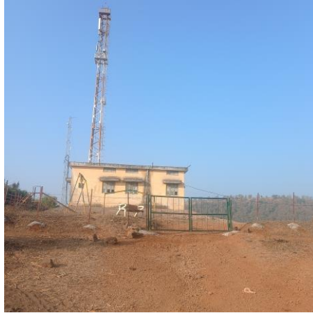
Primary School, Gulerdhana with fencing, gate with lock and khidki