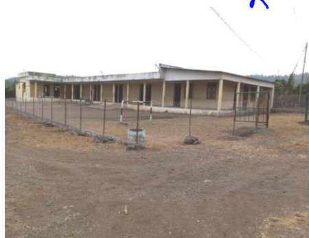
Primary School, Marapadol with fencing, gate with lock and khidki

Everybody in the Neighbourhood, as defined by: Murar Declaration at National Level; and Charitable Incorporated Organisation, at International Level