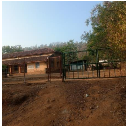
Primary School, Temrubahar with fencing, gate with lock and khidki